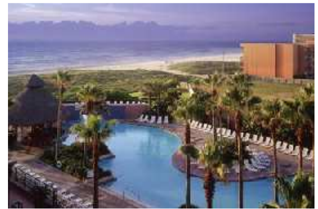
South Padre Island Sheraton

For many universities enrollment is a key revenue-generating component. As a result any institutions enhance their recruitment efforts and obtain a larger pool of applicants to help increase enrollment. Consequently, accurate enrollment prediction is crucial for growth and planning of a higher education institution. Despite the belief that an increase in total applicant pool will necessarily increase total enrollment by the same proportion, our research shows that this is not essentially true. Instead, a better measure to predict the percent increase in enrollment at a specified moment in time. Model building, validation techniques and results will be discussed.